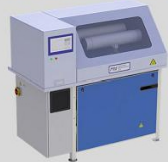
Ultra-Shear Technology (UST)