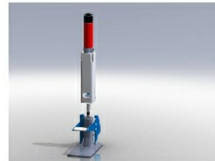
The Shredder SG3