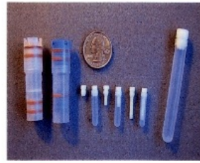
PULSE Tubes and Microtubes with Microcaps